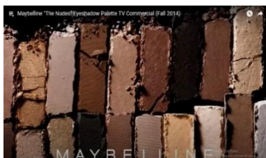
Figure 3.5 The Nudes Eye Shadow Palette

The next visual sign in figure 3.4 which is the signifier is a model that stands close to the window with sharp eyes makeup look with her pose, it very well may be classified as a connotation and interpreted that the model is confident with her eye makeup look by utilizing The Nudes Eye Shadow Palette that on point. The other makeup look is not actually on the tract, it has the reason to establish the impression that the model still looks beautiful and on point even though the other makeup is not really on point. She also used black clothes, black represents confidence, so this color is used to make the sense of elegance and glamour without an excess of color.