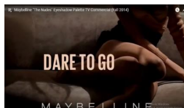
Figure 3.2 The Nudes Eye Shadow Palette

that we need to open our eyes and mindset, then see what is being the newest trend of the makeup look and how could we adjust it. In this context, it could refer to the new makeup look. Because this advertisement launched a new makeup product with a new concept of beauty.