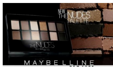
Figure 3.6 The Nudes Eye Shadow Palette

The next visual sign that appears in the advertisement in figure 3.5 shows the shades of the eye shadow, this sign could be categorized as denotative meaning and it has the purpose to give the appearance of the eye shadow color so that people could see the colors before they buy it. This visual sign also has the purpose to help people understand the meaning of The Nudes in this eye shadow product. The meaning of The Nudes in this product means this eye shadow product consist of the colors that looks like the real skin color.