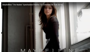
Figure 3.4 The Nudes Eye Shadow Palette

The next visual sign in figure 3.3 is showing a half face of the model with the eye makeup look and it could be classified as a connotative meaning. This sign has the aim to give the appearance of the detailed eye makeup look made by using The Nudes Eye Shadow Palette. It could be concluded that The Nudes Eye Shadow Palette could be applied to the people who have a dark skin color because the woman that is the role model has the dark skin color but the makeup could be on point event the color is neutral. The background used in this scene is black, it could bring the sensation of elegance. This color is used to help make the face of the model on point.